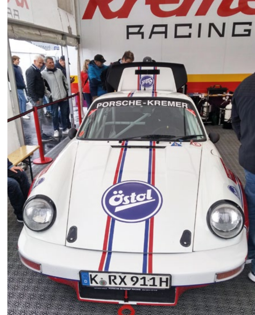
A real "eyecatcher" – the Östol Porsche in the Kremer Racing Team.