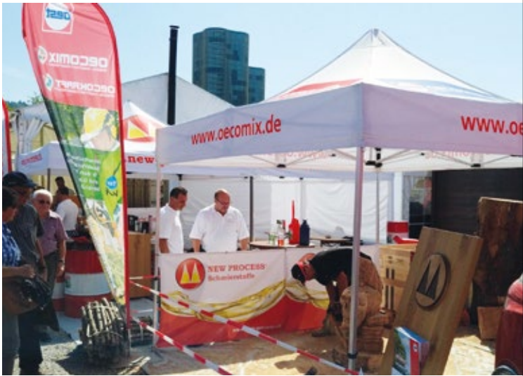
Top: Our high performance special fuels at the Lucerne Forstmesse. Bottom: Headquarters of the Swiss New Process AG in Felben-Wellhausen.