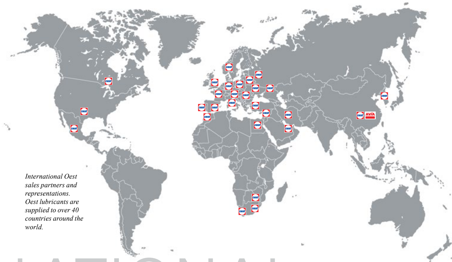
International Oest sales partners and representations. Oest lubricants are supplied to over 40 countries around the world.

International representations and a continuously growing number of sales partners ensure that Oest products “made in the Black Forest” are used successfully in more and more countries worldwide.