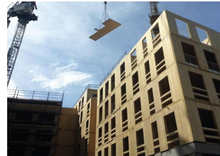
CLT – a pioneering construction material

The CLT elements are manufactured with a high degree of automation. For this, Oest supplies the adhesive application systems as well as any required complete stationary or mobile application portals. 10 additional CLT adhesive application systems are currently in the order books. The demand for cross-laminated timber is expected to grow further in the coming years, primarily due to the increasing use in multi-story buildings.