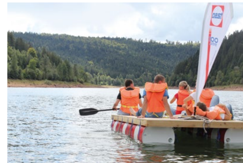
The raft built at the apprentices introduction days was put to the test immediately and proved seaworthy.

And this includes a bit of fun as well, as many joint activities show, for example at a barbecue afternoon with raft building during the introduction days, the shooting of an apprentices’ video for YouTube, regular apprentices meetings at the pub, a customer visit with factory tour at Mercedes-Benz or the bubble football tournament during the apprentices’ day out.