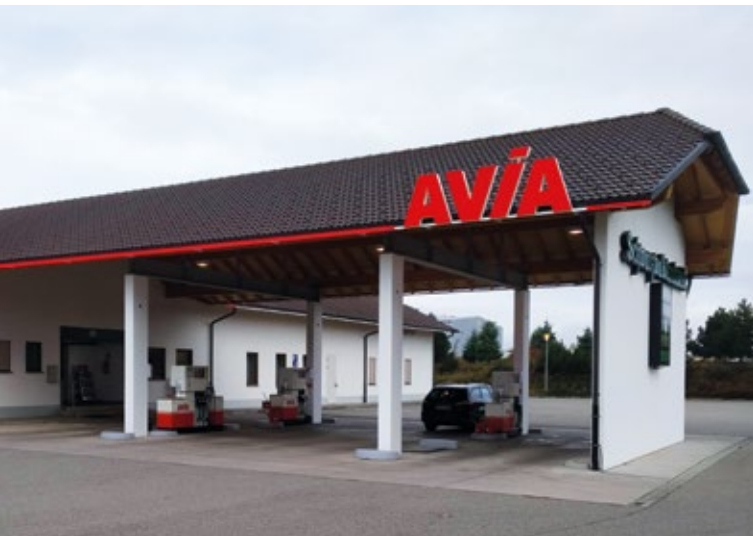
The AVIA Schwarzwaldtankstelle in Dornhan in its new glory.

After extensive technical and structural modernisation measures, the filling station was reopened. In addition to the spacious, weather-protected pump stations, the bistro and shop range was also expanded with baked goods, speciality coffee, tobacco products, a broad selection of snacks and beverages as well as a new Hermes parcel shop.