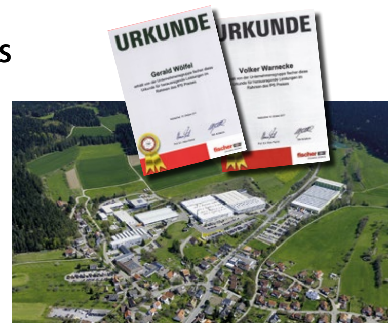
fischer factory in Tumlingen, a long-standing Oest customer.