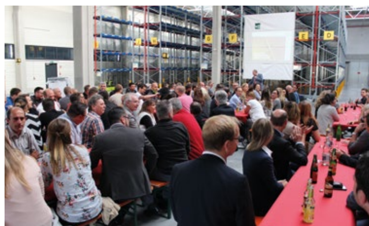
The shelves were still empty at the internal opening ceremony of the new warehouse.

The additional space offers clearly improved storage options, allowing further optimisation of delivery times, despite the very wide-ranging product portfolio with over 700 formulations. Even during peak times, customers can be supplied with products reliably and “just in time”. With regard to the increasing export business with deliveries to many countries worldwide, the new investment delivers added value through the further expanded tax warehouse, which also benefits international customers.