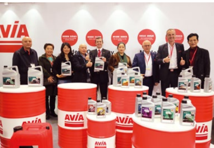
Trade fair participation at Automechanika in Shanghai with our automotive lubricants under the AVIA brand.

Oest Maschinenbau is not the only division to build on rising export numbers for many years – enormous growth rates on an international level were also achieved in recent years with high quality industrial and automotive lubricants, the core business of Oest.