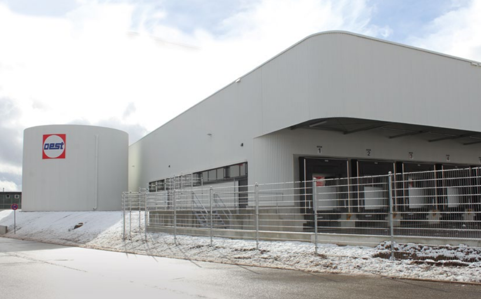
The new warehouse and logistics building.