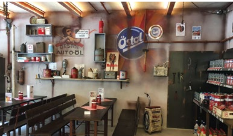
View of the workshop showroom