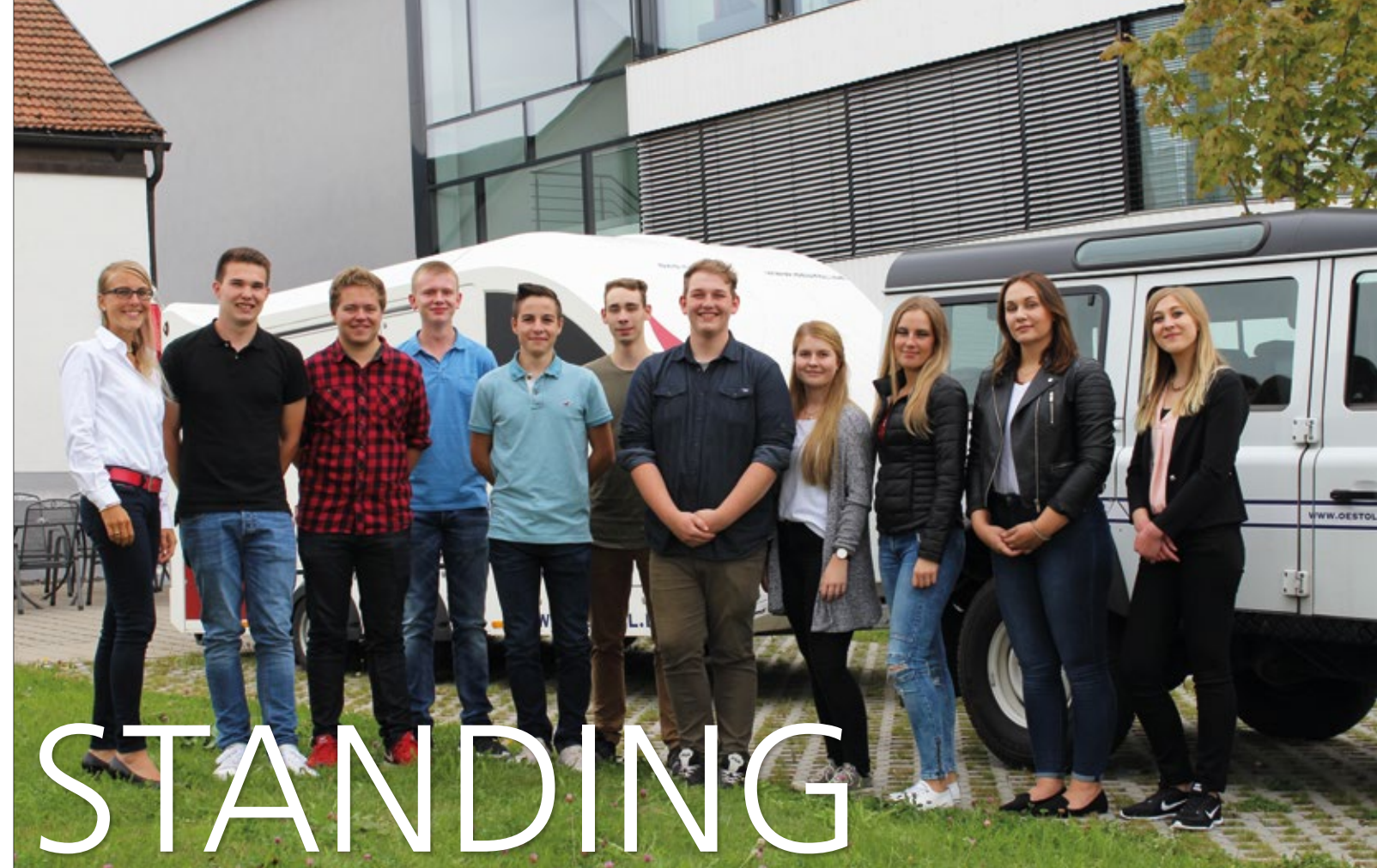
New apprentices and apprenticeship degree students.